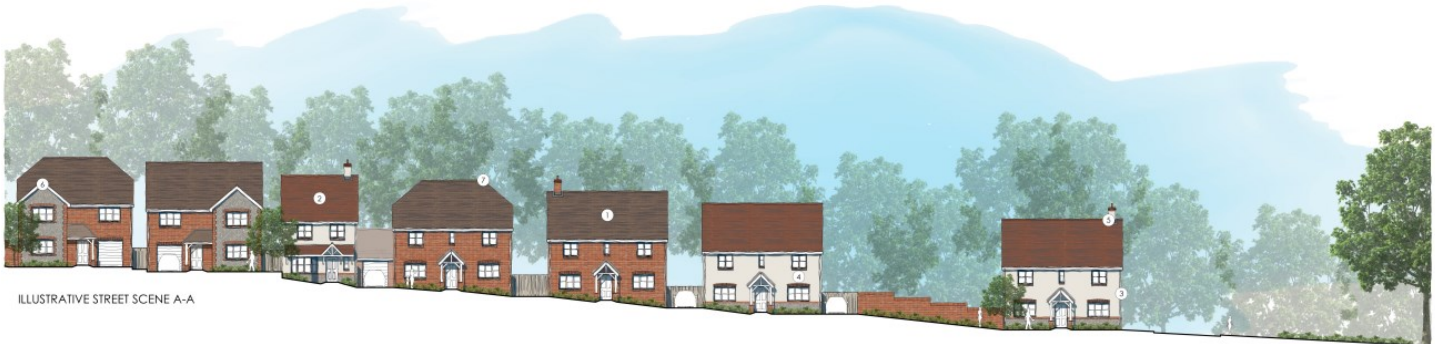
ILLUSTRATIVE STREET SCENE A-A